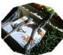
Peggy and Jubjub - the WA Bearded Dragons.