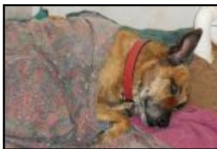
Darla the College guard dog doing what she does best. - always has one ear to the ground listening for thieves and intruders!