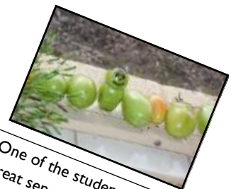
One of the students has a great sense of humour!