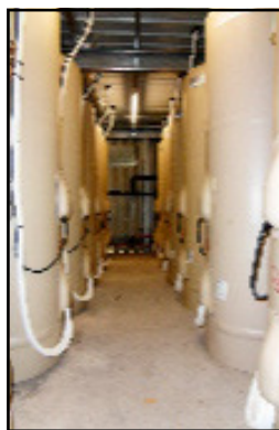
Hot Water Storage Units

We also had an energy efficient audit done but we haven't received the report yet. The College's electricity bill is huge but we are trying to reduce that and be environmentally friendly as well.